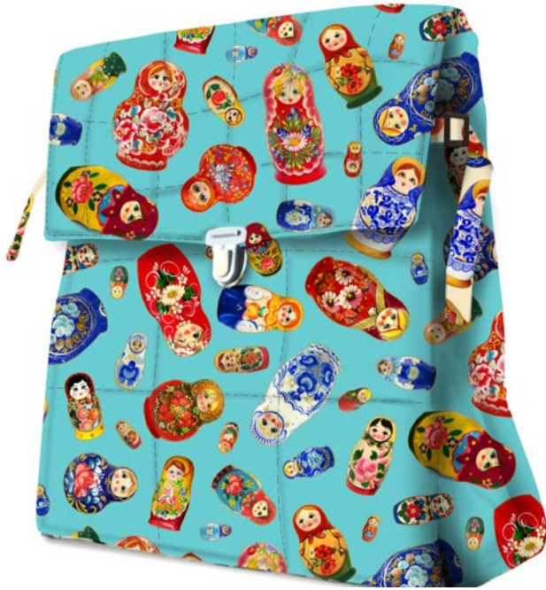
Bag measures about 14" tall and 13" wide