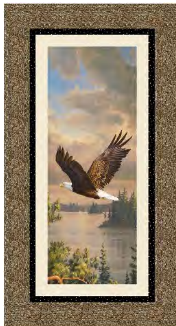
29-1/2" x 54-1/2"