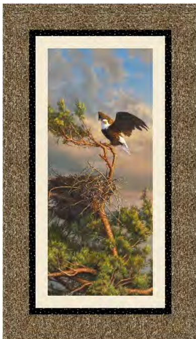
31-1/2" x 54-1/2"

The panel can be divided to create two quilts: