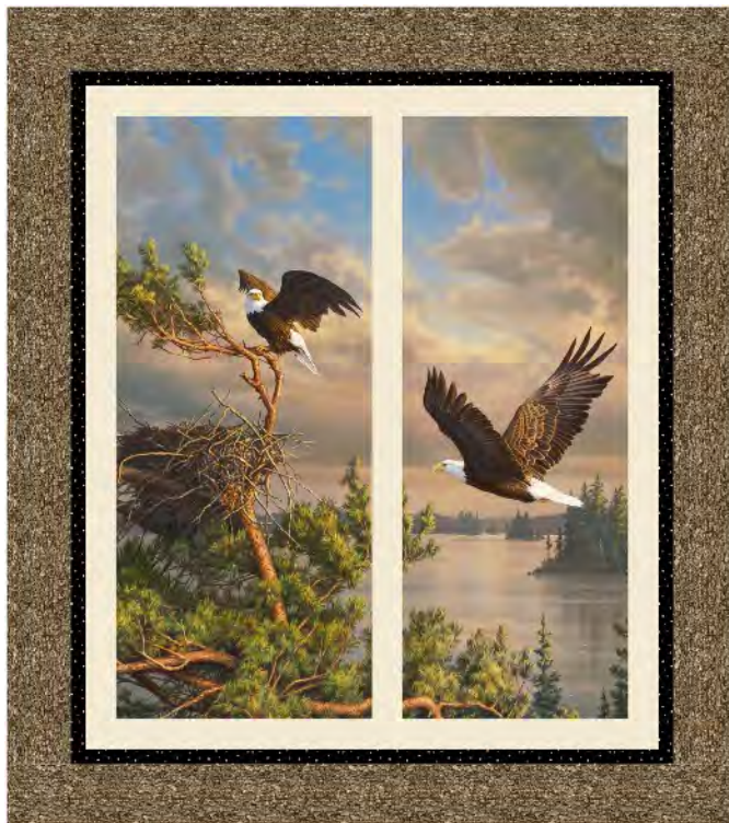
48-1/2" x 54-1/2"

The panel can be divided to create two quilts: