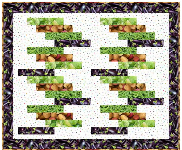
36-1/2" x 30-1/2"

Pattern also has instructions for this version: