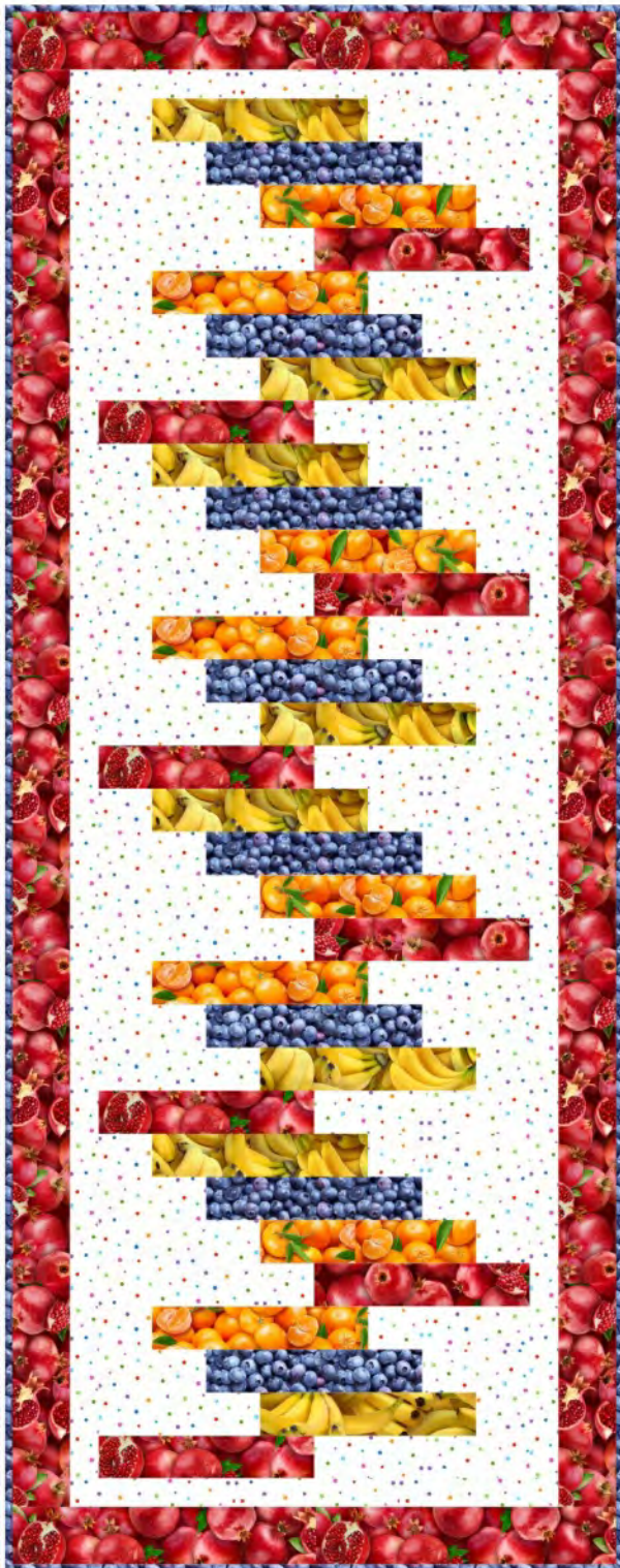
21-1/2" X 54-1/2"

Do not cut fabric from this page: yardage may change. Refer to pattern.