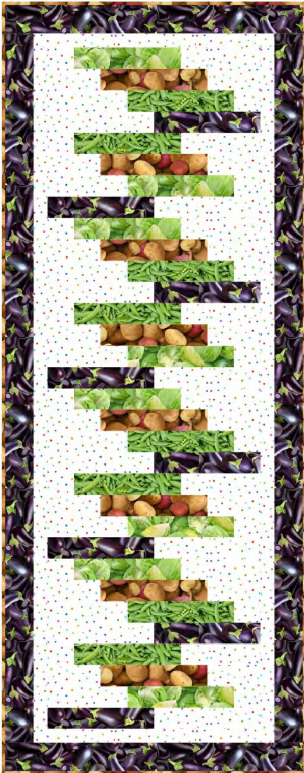
21-1/2" X 54-1/2"

Do not cut fabric from this page: yardage may change. Refer to pattern.