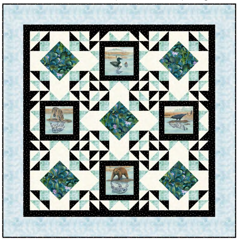
53" x 53"

Design by Brenda Plaster, Spool and Bobbin Quilting Pattern available at www.spoolandbobbinquilting.com