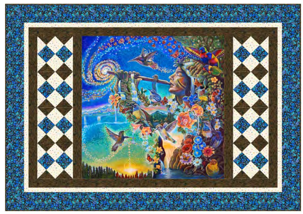
66-1/2" x 46-1/2"