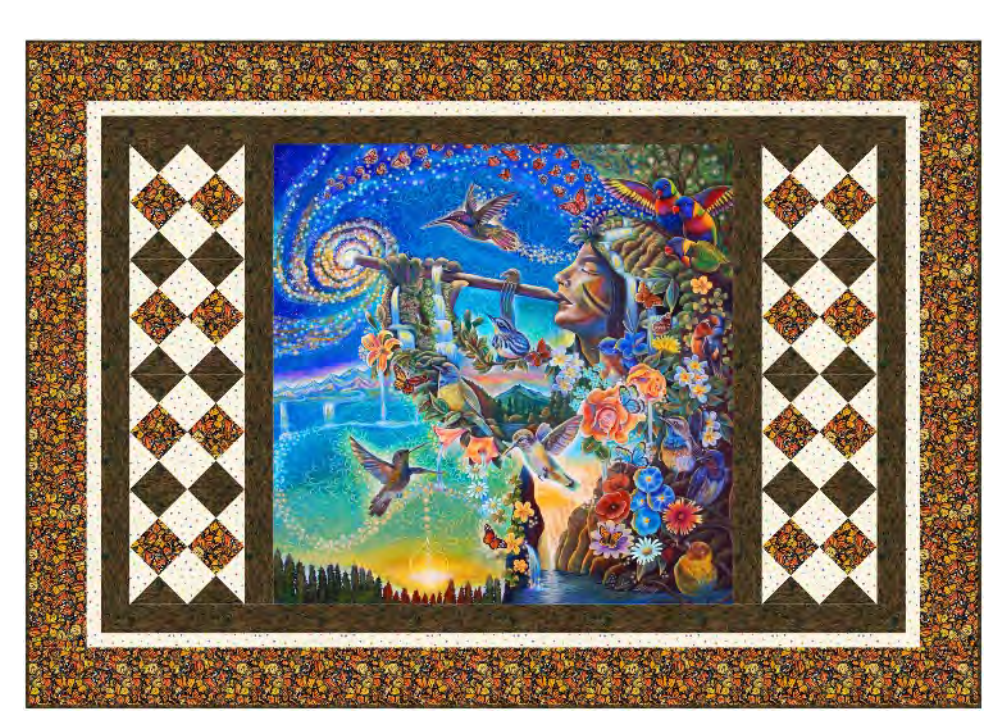
66-1/2" x 46-1/2"