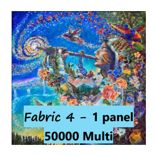
Backing - 3-1/8 yards