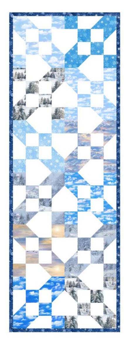
16-1/2" x 48-1/2"